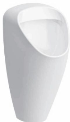
SLP 49 - CAPRINO PLUS RIMLESS